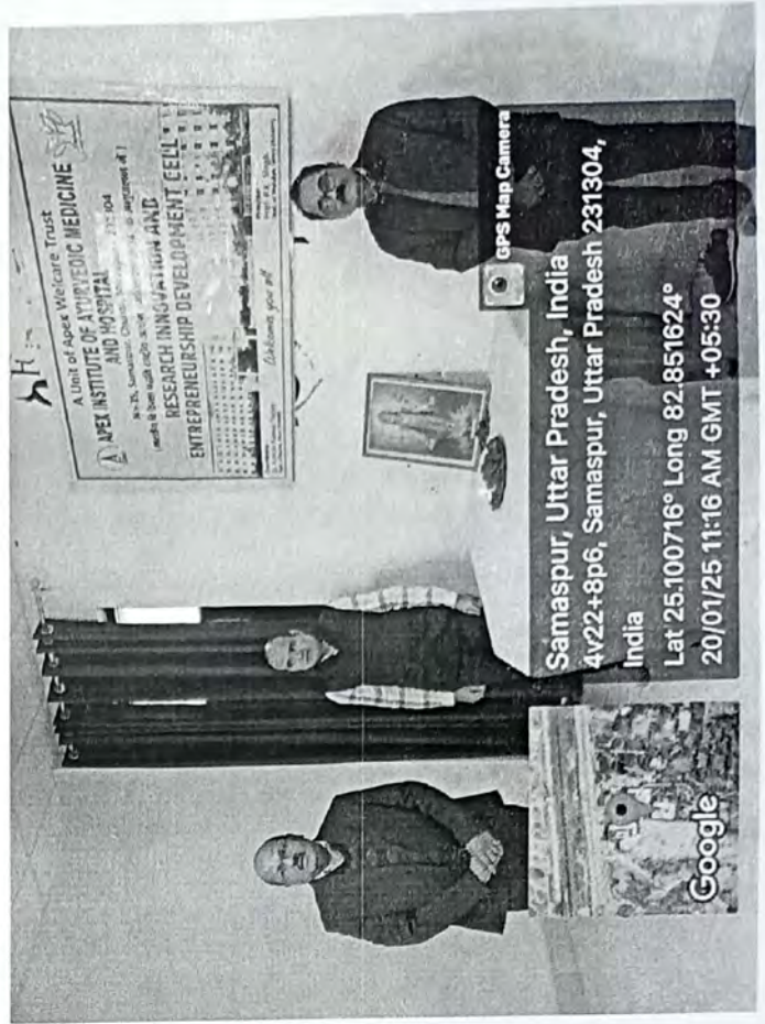
GPS Map Camera Samaspur, Uttar Pradesh, India 4v22+8p6, Samaspur, Uttar Pradesh 231304, India Lat 25.100716° Long 82.851624° 20/01/25 11:16 AM GMT +05:30

APEX INSTITUTE OF AYURVEDIC MEDICINE AND HOSPITAL NH-7, MIRZAPUR - VARANASI ROAD, SAMASPUR, CHUNAR, MIRZAPUR