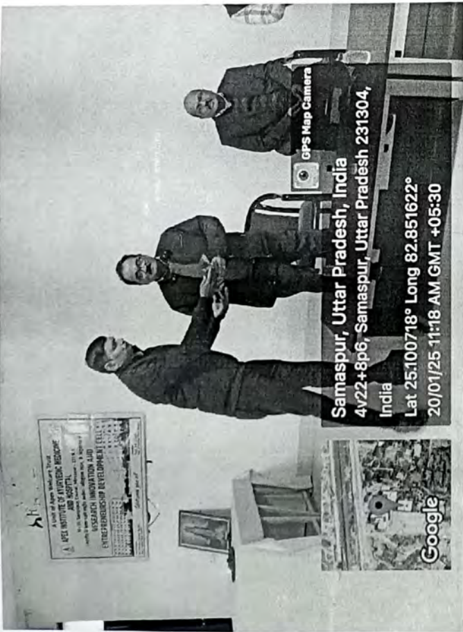
GPS Map Camera Samaspur, Uttar Pradesh, India 4v22+8p6, Samaspur, Uttar Pradesh 231304, India Lat 25.100718° Long 82.851622° 20/01/25 11:18 AM GMT +05:30