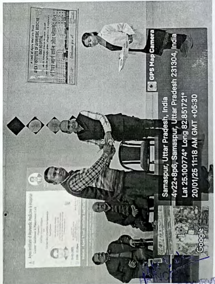
GPS Map Camera Samaspur, Uttar Pradesh, India 4v22+8p6, Samaspur, Uttar Pradesh 231304, India Lat 25.100774° Long 82.851721° 20/01/25 11:18 AM GMT +05:30